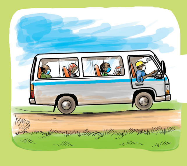
Protecting Each Other