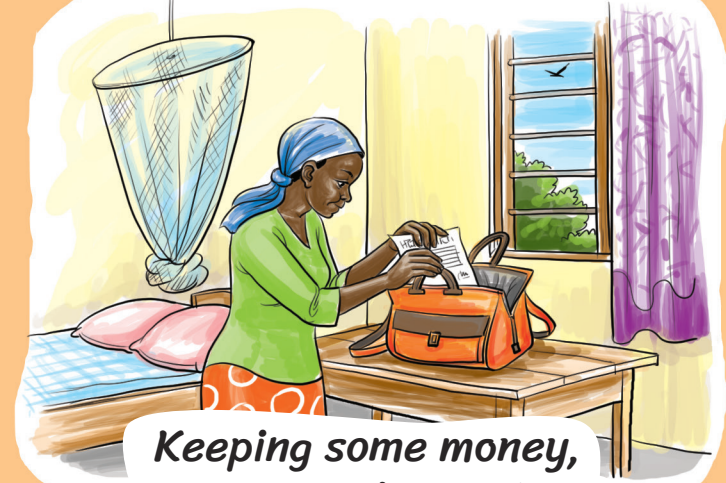
Keeping some money, airtime and important papers in a safe place