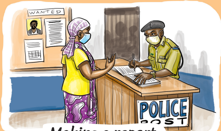
Making a report

Seeking support is a positive use of your power.