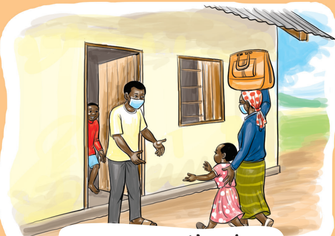
Staying with other family during lockdowns