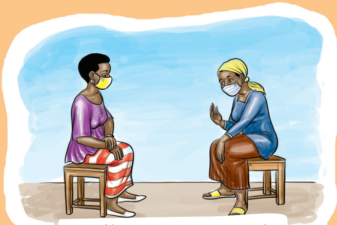
Talking to a friend or counselor