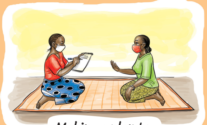
Making a plan to stay safe