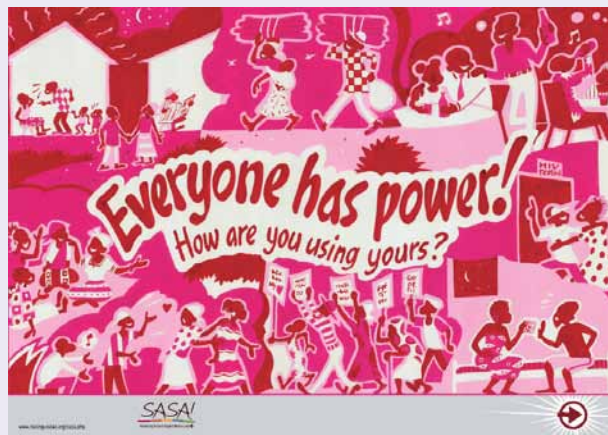
Group 3: Power Poster