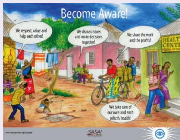
Group 4: Community Poster